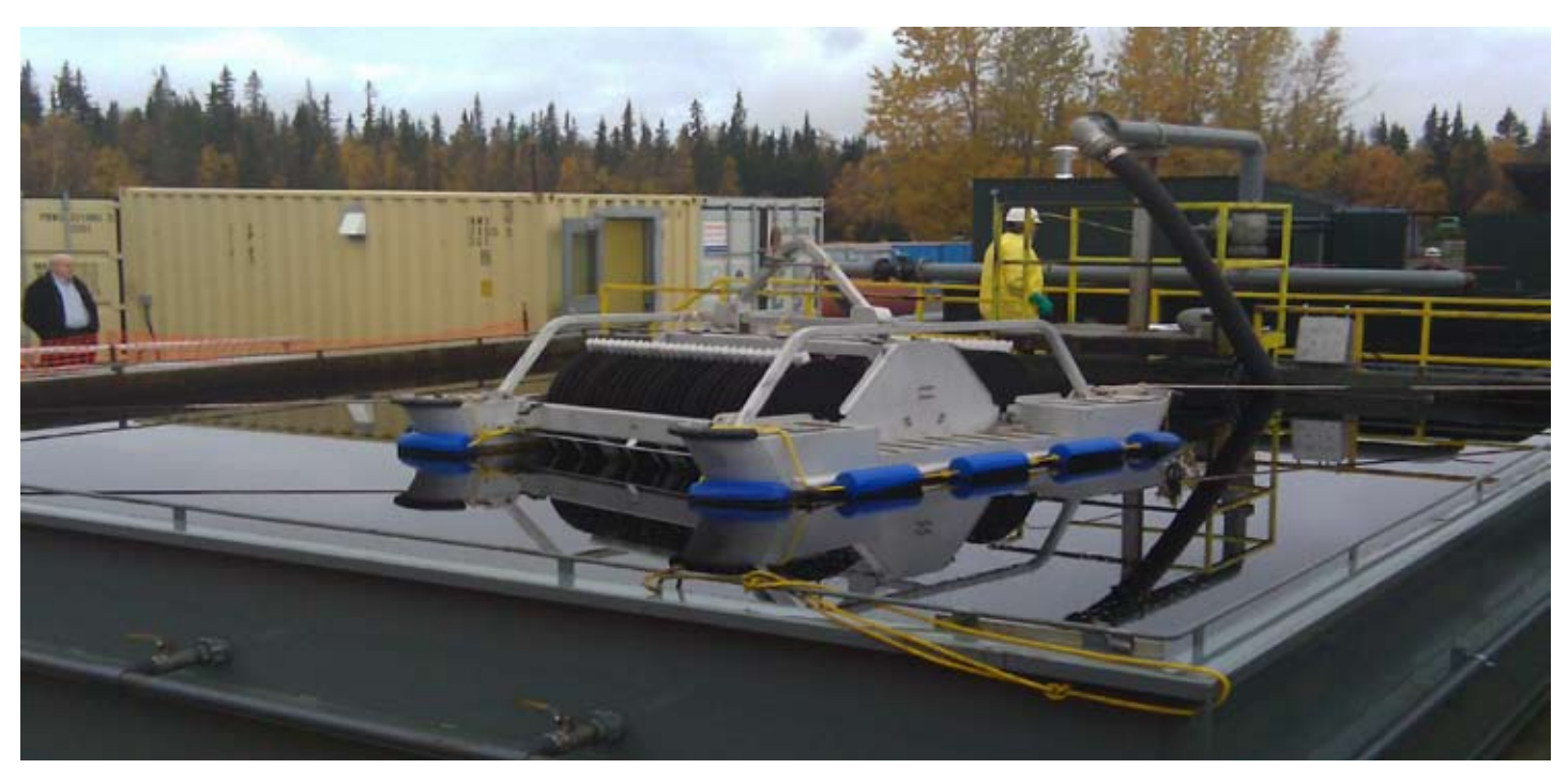
CISPRI's on-site test tank allows the newest technology to actually recover oil in comparable Cook Inlet salinity, and even ice conditions