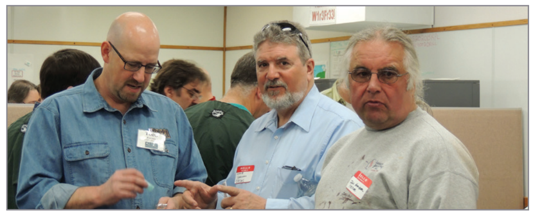
CIRCAC participates at CISPRI Command Center for a Cook Inlet oil spill drill.

In addition to participating in the ConocoPhillips drill, CIRCAC also participated in Tesoro Vessel Plan and Cook Inlet Pipeline (CIPL) drills; filling specific duties in the Environmental, Joint Information Center, and Operations sections of the Incident Command System.