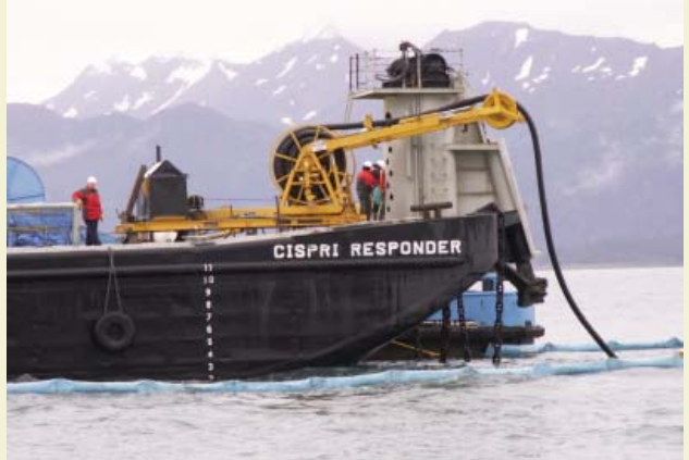
The barge CISPRI Responder, deploys a Transrec weir skimmer to oil recovery.

Tesoro held its annual drill and deployment September 24th and 25th. The drill scenario centered on an incident involving the TV Seabulk Arctic as it made its way from Valdez to Nikiski. Cook Inlet RCAC served as drill evaluator in the Nikiski Command center and as a participant in the Community Stakeholder Committee in Homer. The two-day drill started with a table top exercise designed to test the Unified Command and the abilities of the Tesoro Incident Management Team.