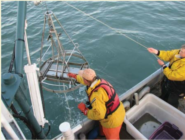
Tim Roberson and Sue Saupe

The two projects combined for the Integrated Cook Inlet Contaminants Program (Integrated Plan) were (1) a Cook Inlet area-wide contaminants study by Cook Inlet RCAC based on the national Environmental Monitoring and Assessment Program (EMAP) and (2) a Produced Water Discharge Study required by the Cook Inlet Oil and Gas NPDES Permit (AKG-31-5000) for large volume produced water dischargers designed to assess the fate and transport of produced water in the water column and sediments.