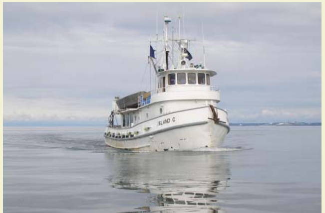
R/V Island C.