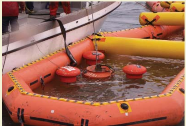
The Wave Buster funnels rough water and oil to the skimmer. As the rough water travels through the wave buster, it calms, and the skimmer can effectively recover the oil.

Following Wednesday's table top exercise, the second day involved a large-scale deployment of response equipment in Katchmak Bay. Cook Inlet RCAC was invited to observe the deployment and implementation of the Petersen Bay GRS, several near shore response tactics, and a lightering operation of the T/V Captain Downing. Cook Inlet Spill Prevention and Response, Inc. (CISPRI) and Ship Escort/Response Vessel Systmes (SERVS) took part in the deployment.