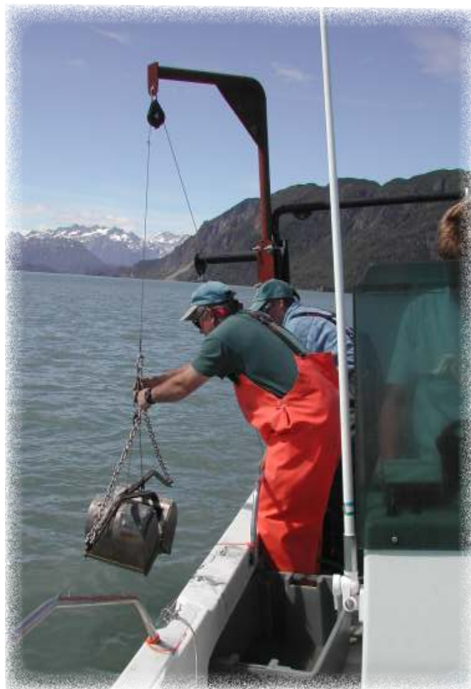
EMAP Crew member retrieves a Young-modified VanVeen grab with a sediment sample.

Sediment toxicity for Southcentral Alaska estuaries is rated good. Sediment toxicity was determined using a static 10-day acute toxicity test with the amphipods Ampelisca abdita . While use of Ampelisca standardizes the sediment toxicity test within the EMAP National Coastal Assessment process, this test may or may not reflect actual response of specific benthic organisms indigenous to Alaska. The State of Alaska has yet to develop specific benthic species for use in sediment toxicity studies, but considers the EMAP work important in supporting future efforts to develop an Alaska sediment toxicity test. Sediment was deemed toxic if the amphipods had less than an 80% control-corrected mean survival rate. Sediments in 1% of the estuarine area of southcentral Alaska. were toxic to amphipods.