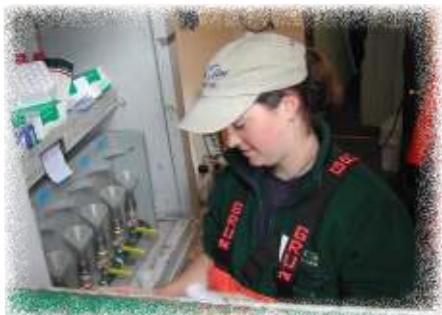
Samples are prepared for analysis on the Ocean Cape Vessel

Only four sites, located in Upper Cook Inlet area, had light penetration at 1 meter less than 10% of surface illumination. At these locations very high loadings of glacial river sediments occur during the summer peak flow period. Thus, the low levels of light penetration observed at the four sampling sites are indicative of naturally occurring conditions representing summer high-flow input of suspended sediments at the time of sampling. During winter low flow suspended sediment loading significantly decrease due to greatly reduced glacial river inputs.