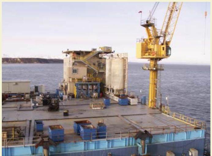
The deck of Pacific Energy's Osprey Platform.