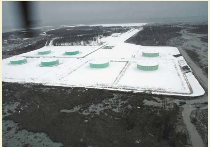
Drift River Tank Farm after initial lahar.

Prior to the eruption the RCAC staff organized a briefing for the Council from Cook Inlet Pipeline, Chevron, the United States Coast Guard, the Alaska Department of Environmental Conservation, and other regulatory agencies. After the briefing, the Council had a better understanding of the protective improvements Cook Inlet Pipeline had made to the facility and was assured that the oil reserves would be kept to a minimum. After the eruption caused substantial flooding at Drift River, the improvements to the dike system and the addition of the tertiary containment proved functional and protected the oil tanks. The CIPL employees evacuated the facility.