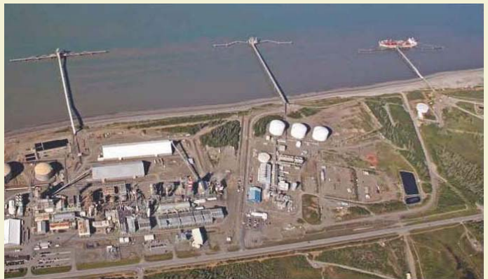
Top: Pacific Environment group poses with Doug Lentsch at CISPRI. Bottom: Agrium dock, ConocoPhillips dock, and Tesoro KPL dock.