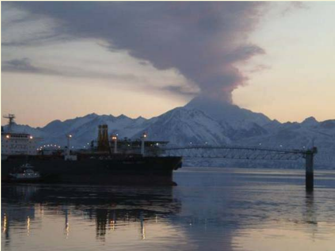
Seabulk Arctic at the Christy Lee Platform.

While most of Unified Command was focusing on minimizing risk at the Drift River Tank Farm, personnel from various agencies and industry and Cook Inlet RCAC were also focusing on gathering information and planning for any potential response activities if oil spilled. RCAC staff on scene compiled information and recommendations to help understand and evaluate risks based of various potential response scenarios.